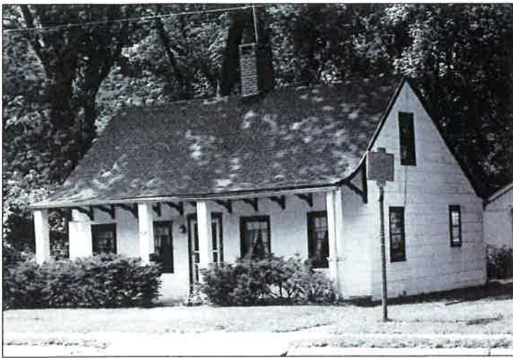
Town Arsenal built as a residence in the mid 18 th century. Served as the town arsenal before the Revolution; presently a town museum.