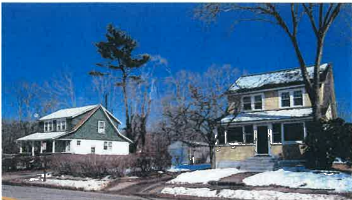
Eastern two houses Sabbath Day Path

Old Huntington Green, Inc. was concerned with more than just preserving open space in the Village Green area. The group also wanted to preserve historic structures. First it had to determine which early buildings remained in the valley stretching from the Green to the harbor. After exhaustive research, 32 buildings were identified. In 1937, Lester B. Pope, supervisor of the Pratt Institute's Architectural Department and district officer of the Interior Department's Historic American Building Survey on Long