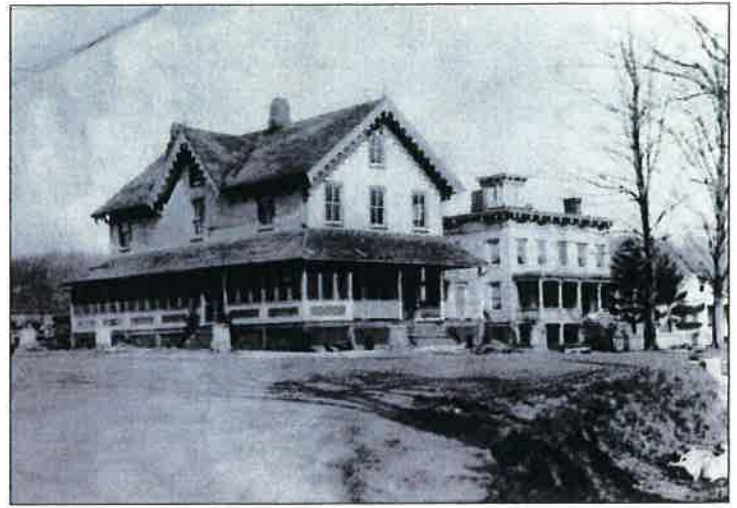
Woodhull Corner. The site of Platt's Tavern. Park Ave. and East Main Street