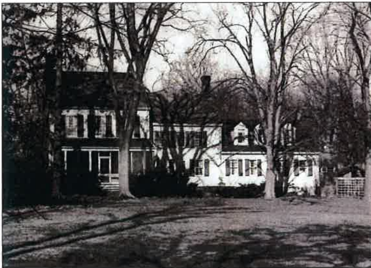
Cannon House. Built 1805

divided into four different lots, one of which contained the house Mrs. Cringle had built in 1914. A fifth lot was located between these lots and the North Meadow. The remaining pieces of the Hoban Farm had been divided into eight small lots on Sabbath Day Path, each with a house.