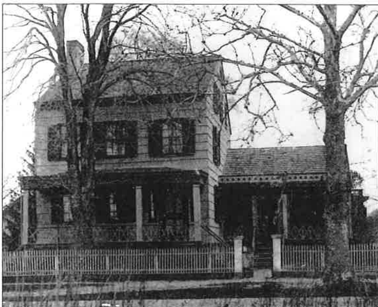
366 Park Ave. 1885. One of 32 historic houses still standing in the Village Green district.

The biggest obstacle to the completion of the Heritage Trail was the 7.2 acre Park Avenue Dairy site at the corner of Park Avenue and Woodhull Road. The property not only was mostly open fields and woods, it also contained a wealth of historic structures. First settled in the seventeenth century, the land had been used for some 266 years to graze cattle. It also was the site of a tannery; and during the American Revolution Hessian troops camped there. The property includes houses from the seventeenth, eighteenth and twentieth