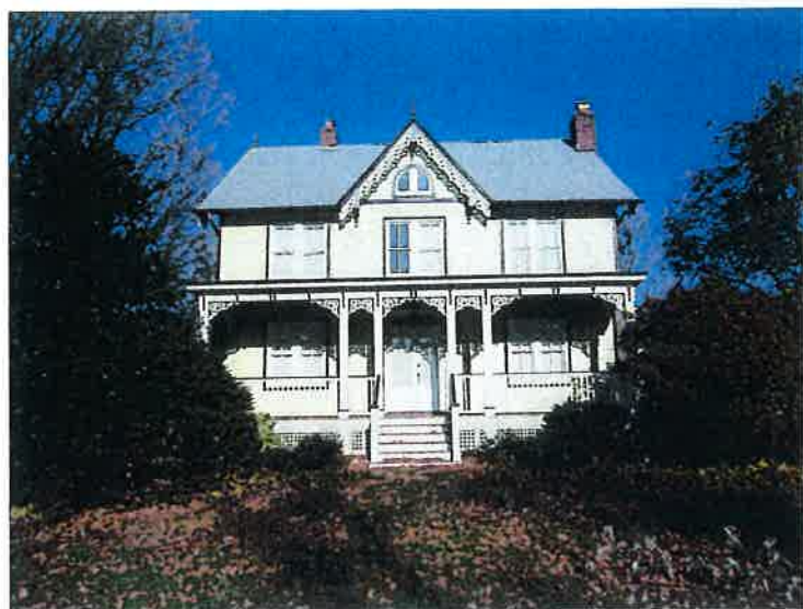
Sunny Pond Farm House

But who will take the lead to implement this vision?