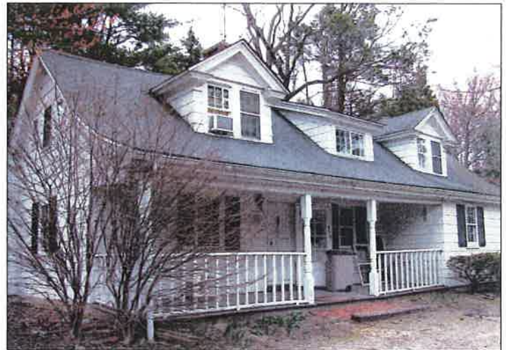
The Ketcham House. Moved from Fort Solanga to the Sunny Ponds property on Park Ave.