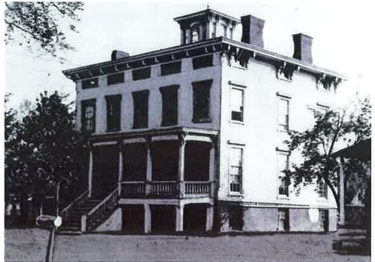
J.A. Woodhull House 1860. Built on the site of Platt's Tavern. No longer standing.

Island, was asked his opinion of the historic value of Huntington's old buildings. He replied that "Old Huntington offers, I believe, one of the most unique historic areas that we have—certainly on Long Island. It presents an old township which with ease could be restored to its original historic layout and atmosphere." 25 Today, of those 32 houses, all but six still stand. Of those that remain, all but four are now protected by local landmark designation. The Association's plan called for preserving these historic structures and moving other historic buildings—such as the Historical Society's Conklin House—to the Village Green area for protection from unsympathetic development.