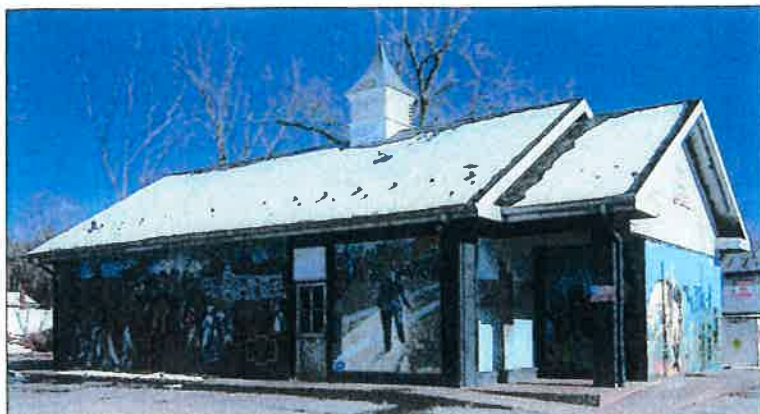
Current Incarnation of Gas Station

centuries as well as a 1915 cement dairy barn and tile silo. The property was a dairy until 1958.