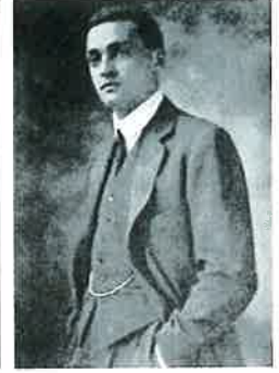
Marshall Field III

Sabbath Day Path. They called themselves the Committee on the Preservation of Old Huntington. The first order of business was to convince the Town Board to clean up the Green, not only for the sake of civic pride, but also as a way to provide jobs at the depths of the Great Depression.