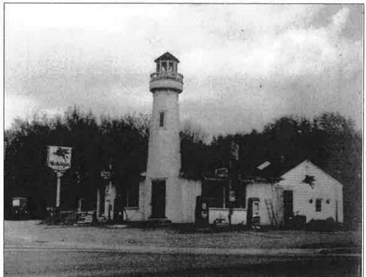
Early Gas Station at corner of 25A and Park Ave.