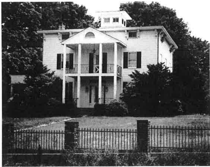
Smith Woodhull House, corner of Jackson and Main St. One of 32 historic houses that still stand today.

“All pictures in this article are from the collection of The Huntington Historical Society. If you are interested in purchasing a reproduction please call: 631-427-7045 x406”